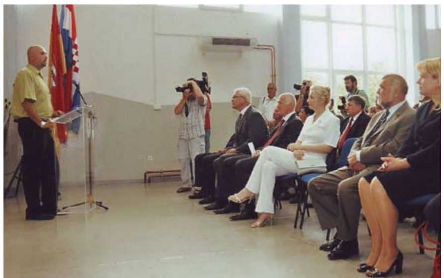
Kamanje, 7th August 2008

Support: National Foundation for Civil Society Development (HRK 100,000)