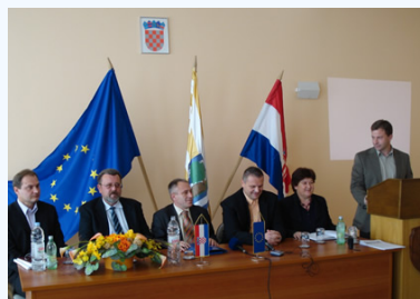
Signing contract for a tourist ship building within the E.R.S.P.A. project

experts was organized aimed at analysis of the situation and development of tourism strategy for the Srijem region, initial activities related to development of the sustainable wine-making strategy for the Srijem region, followed by a technical excursion to Italy which enabled the participants to learn about the examples of good European practice in tourism and vine-growing.