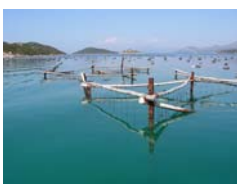
Oyster farm in the Malostonski bay

The loan guarantee fund will be deposited for a fixed term of 6 years at an interest rate of 4%, and the interest earned will be donated to the beneficiaries to reduce their loan interest.