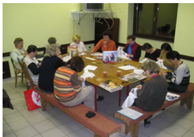
Almaš - Workshop on local embroidering of the traditional costume

The project aim is strengthening the role and participation of citizens by organizing and actions of formal advisory bodies in the local self-government units dealing with civil society development issues and preparation and implementation of a transparent system of financial support to NGOs from the local self-government unit budgets. Partners on the project are the cities of Drniš and Benkovac, and municipalities of Kistanje, Erdut, Jagodnjak and Šodolovci.